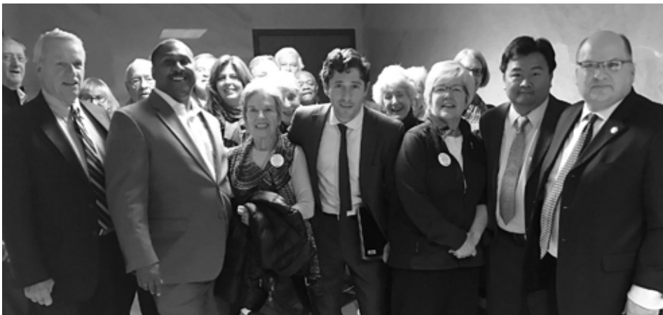
CELEBRATING THE FUNDING OF GREAT RIVER LANDING ARE PLYMOUTH MEMBERS, BEACON INTERFAITH COLLABORATIVE LEADERS AND CITY OFFICIALS.

Construction is estimated to begin in late 2017.